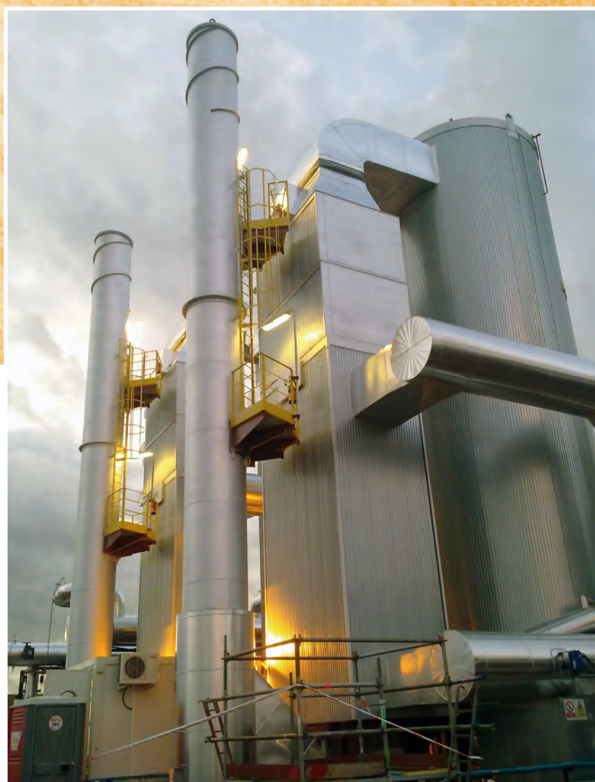
25-MW THERMAL OIL BOILERS AT THE SOLACOR I PLANT, CÓRDOBA (SPAIN).

Since its early days, E&M Combustión has been committed to the development of burners with the lowest possible pollutant emissions, while at the same time also committing itself to partici-